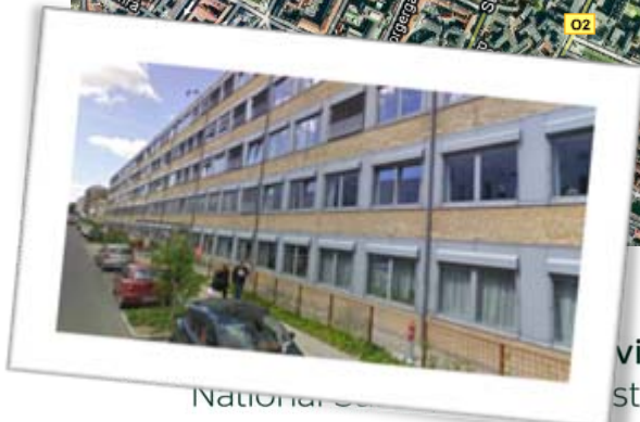
National Environment stre